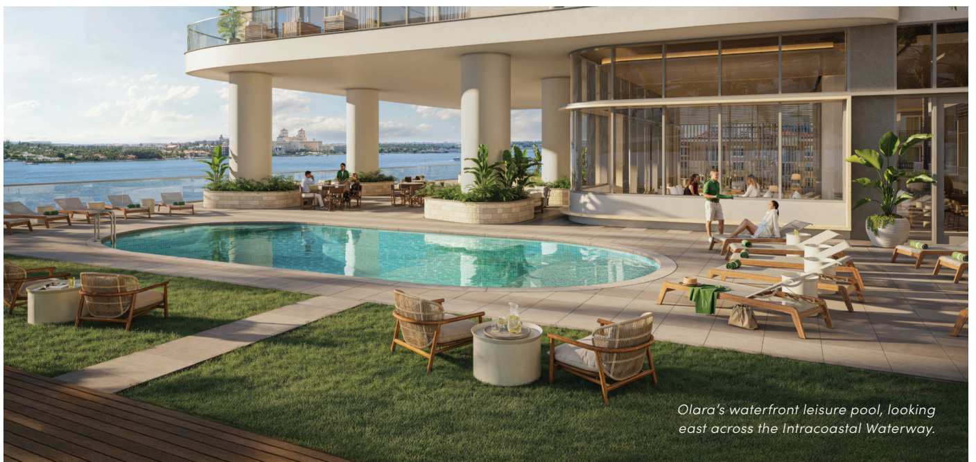
Olara's waterfront leisure pool, looking east across the Intracoastal Waterway.