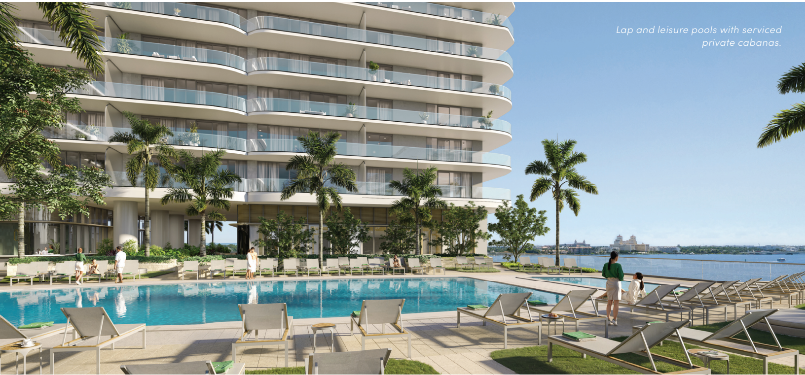
Lap and leisure pools with serviced private cabanas.

Everything you need to embrace a life of ease is at your fingertips: dining led by the José Andrés Group, wellness designed by The Wright Fit and managed by Arch Amenities, 24/7 medical concierge by Sollis Health, and a private marina with access to a captained fishing boat and cruising yacht.